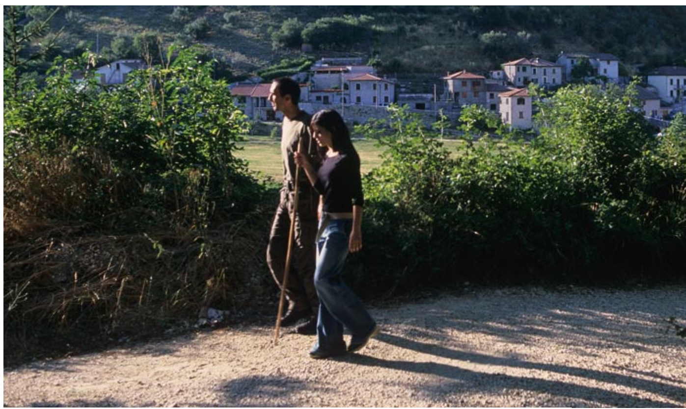
The Via Francigena connects Assisi with Rome through the hills and valleys along much of the path that St. Francis would have traveled.

The entire route is 250 kilometers long (150 miles). It is divided into 14 stages covering roughly 10-12 miles of walking per day. We offer options of walking either the entire Via of 14 days, or abbreviated portions of 7 days, or 4 days.